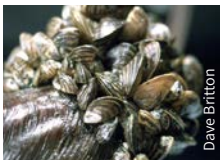
Zebra & Quagga Mussels