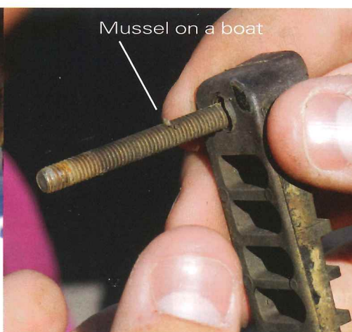
Mussel on a boat